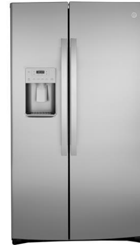
Model#: GZS22IYNFS GE® 21.8 Cu. Ft. Counter-Depth Fingerprint Resistant Side-By-Side Refrigerator