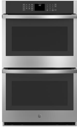
Model#: JTD3000SNSS GE® 30" Smart Built-In Self-Clean Double Wall Oven with Never-Scrub Racks