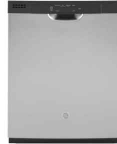
Model#: GDF510PSMSS GE® Dishwasher with Front Controls