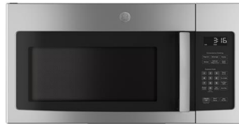
Model#: JVM3162RJSS GE® 1.6 Cu. Ft. Over-the-Range Microwave Oven