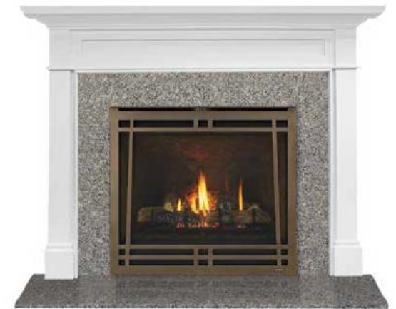
Roxborough – Upgrade A, #2835