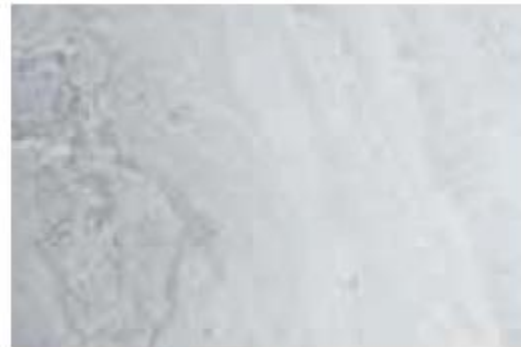
ARCTIC GRAY MARBLE - POLISHED SURFACE