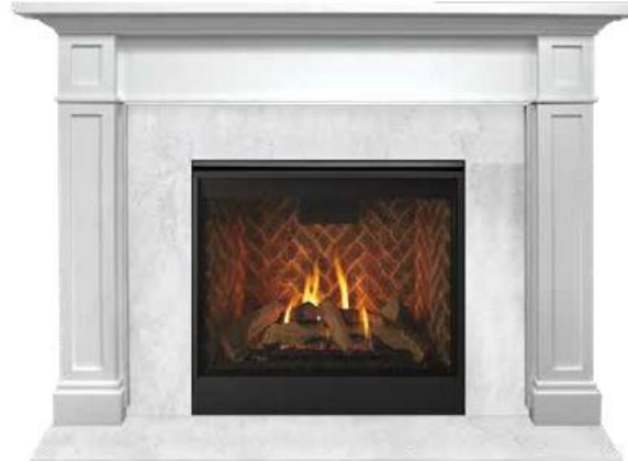
Acadia – Upgrade A, #2835