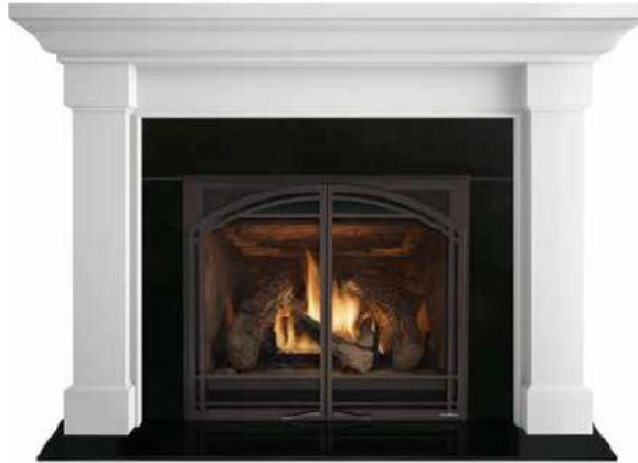
Kenwood – Included