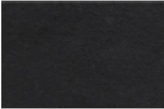
SLATE - MATTE SURFACE