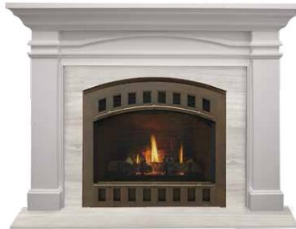
Portico – Upgrade B, #2836